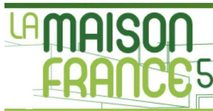
5 episodes on Dutch Design