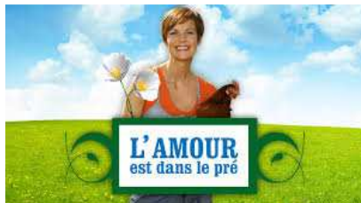
un weekend Amsterdam

Local Film, TV & Radio Production references: